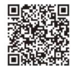
Alumni Information Update

To support environmental protection and our paperless initiative, please scan the QR code to update your information online. YZU will use this information for future updates and benefits. Additionally, to enhance YZU's global visibility, we encourage you to create your background page on Wikipedia and LinkedIn, linking it to YZU. Thank you for your continued support!